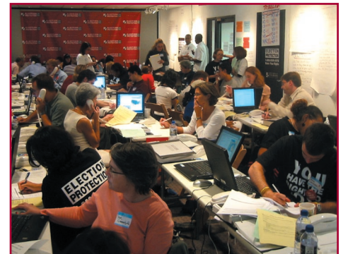
November 2, 2004: Volunteers at the Election Protection National Command Center use binders of election laws supplied by Zuckerman Spaeder.

granted intervention, reopened the case, and required immediate discovery. Following another hearing on November 1, 2004, the federal court found the RNC in violation of the consent decrees and enjoined it and its challengers from using voter lists to challenge voters in the November 2, 2004 national election. However, the 3rd Circuit en banc granted the RNC's emergency motion for a stay pending appeal. The case is Democratic National Committee v. Republican National Committee , before Judge Debevoise of the U.S. District Court for the District of New Jersey.